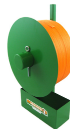
6075 Forklift Mounted Strap Dispenser