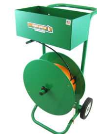
6071 Rolling Strap Dispenser