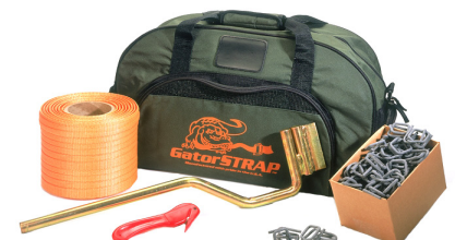
6080 Available for all products.