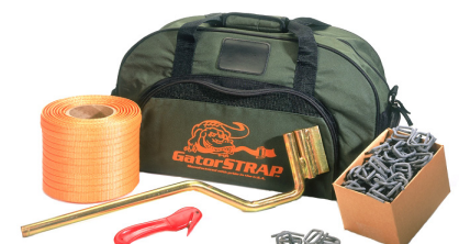
6080 Available for all products.