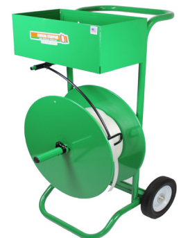
6071 Rolling Strap Dispenser